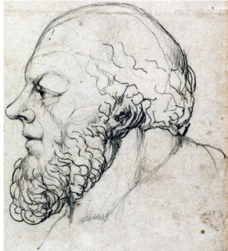
William Blake, Socrates, a Visionary Head

Blake wrote on his print of The Laocoön that 'If Morality was Christianity Socrates was the Saviour'.